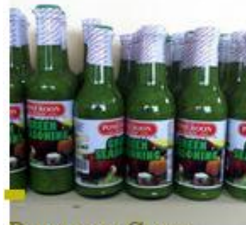
Pomeroon Green Seasoning