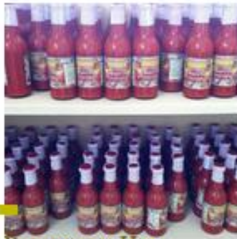
Pomeroon Hot Pepper Sauce