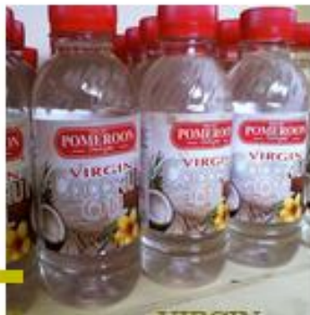
Pomeroon VIRGIN Coconut Oil