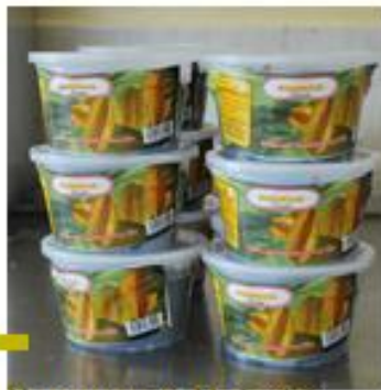
Pomeroon Delight Carambola Fruit Mix