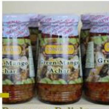
Pomeroon Delight Green Mango Achar